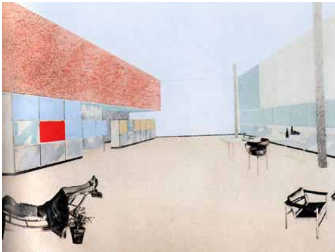
equipment d'intérieur salon d'automne, parigi 1929